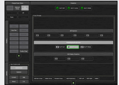
Manage groups and subgroups of projectors