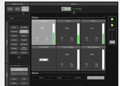
Control all relevant image settings with one touch

APPROVED FOR PUBLIC RELEASE; DISTRIBUTION IS UNLIMITED